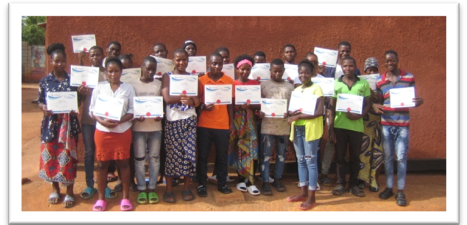
FIGURE 6 & 7: Computer and Tailoring & Design Graduates

We sent 12 students to attend a computer course. There, they learned how to use Microsoft Word, Excel, Outlook, Access, and Powerpoint. With the skills they've acquired and the certificates they've earned, they have a greater chance of finding a job. We were also able to send 16 students to a tailoring course where they will acquire new skills that could eventually help them earn an income.