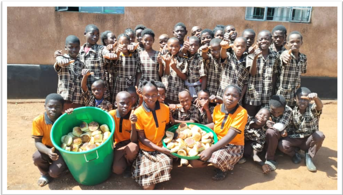
FIGURE 10: Weekly bread rolls made by female inmates

Our partnership with the Female local correctional service continued with a small bakery. The inmates make and sell the bread rolls to our community school in order to sustain the feeding program. From the profits of the bakery production unit the prison was able to purchase 4 big pots, 1 submersible borehole pump, a drip irrigation kit with pipes, 10 hoes, 1 wooden door, 4 bags of fertilizer, and 10 kg of maize seeds.