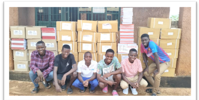
FIGURE 4: New Books for all students

Stationaries and uniforms were provided for all students from grade 1 to 7. This removes the financial burden on the parents and allows the children to have easier access to education.