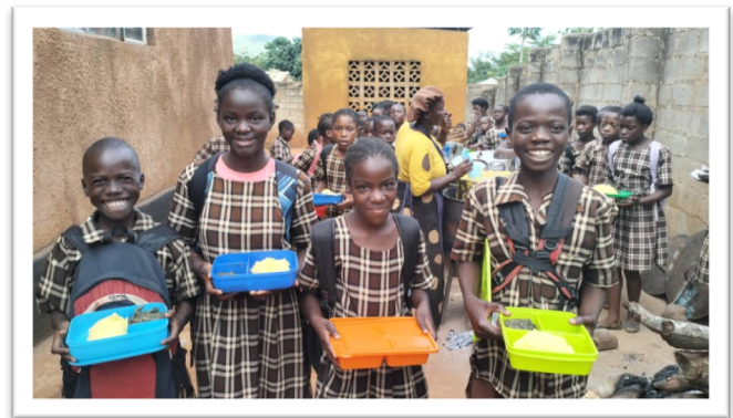
FIGURE 1 & 2 : Pupils Enjoying Lunch

The feeding program continues to provide 'a meal a day' for all pupils from Grade 1 to Grade 7. This motivates, especially, the more vulnerable children to come to school every day. The intake of the right nutrients increases the concentration of the children during the lessons.